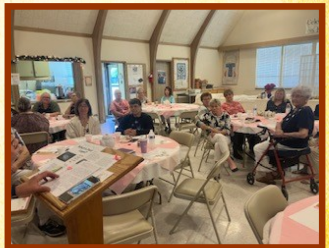
Lots of Ladies attended the annual Presbyterian Women's Ecumenical Brunch Saturday, August 2, 2025